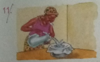
Identify the method of cleaning water shown in the picture. _____