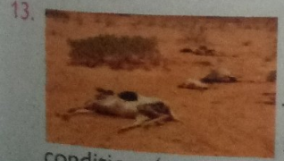
This picture shows a _____ condition. (rainy, drought, flood)